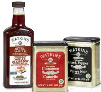
GOURMET pages 3-15

All of the above Points of Superiority make up THE WATKINS WAY, and you will agree that it is a good way.