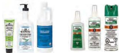
REMEDIES by J.R. Watkins pages 16-21